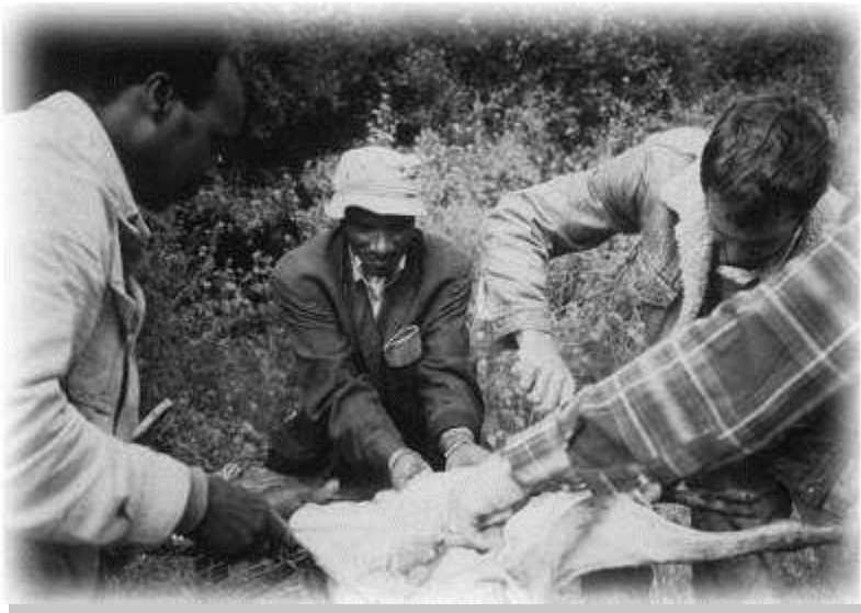
Right: Butchering our meal