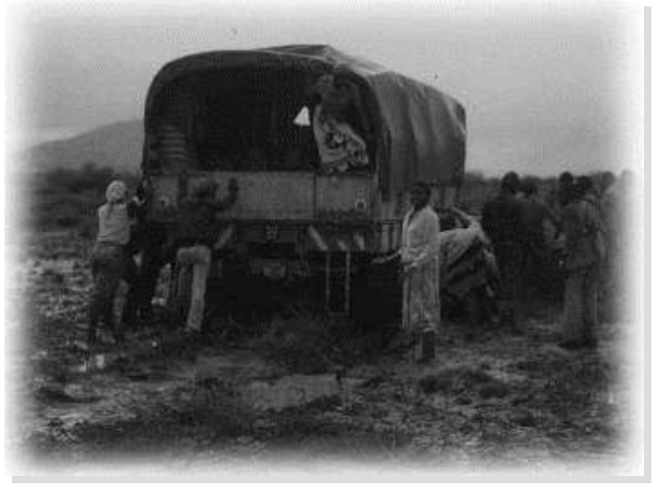
Middle: Tea break on the road, more pushing!