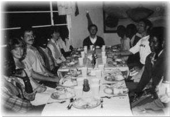
Christmas Dinner Gatab 1986